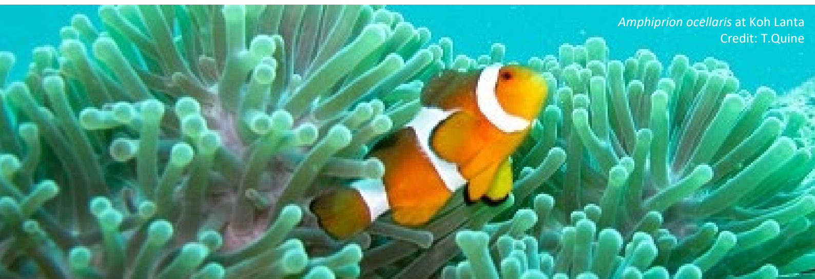
Amphiprion ocellaris at Koh Lanta

Thailand’s Public Prosecutor initiated criminal charges against five defendants arrested in February 2018 for hunting wildlife within Thung Yai Naresuan Wildlife Sanctuary, including a rare black panther. In parallel, the Department of National Parks (DNP) filed a civil claim against the offenders, under Section 97 of the NEQA Act, requesting compensation for the harm caused to biodiversity (plus interest). The Supreme Court verdict not only ordered several years of imprisonment, but also granted THB 2 million in compensation (Supreme Court Case No. 1203/2564).