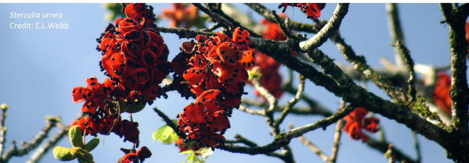
Sterculia urnea